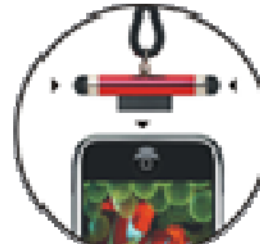
Press the both Ends of pens