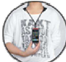
Hung on neck